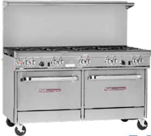
4601DD (shown with optional casters)

Configure your own custom spec sheet and model number at www.BuildMyRange.com. Refer to AutoQuotes for list pricing.